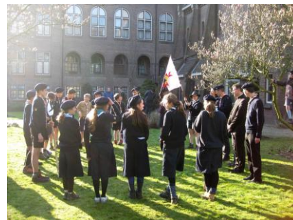
Dutch Guides and Scouts of Europe

During the consecration, we ask Jesus to give us all his strength to love God and transform our heart in the likeness of His Heart.