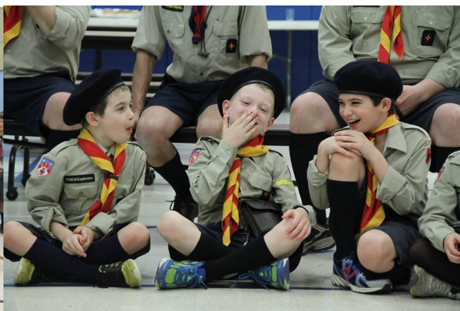
We have fun together

Newsletter from the International Union of Guides and Scouts of Europe Federation of European Scouting