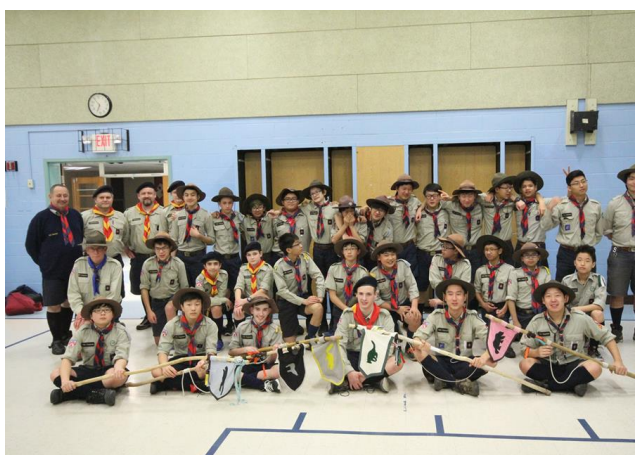
The two troops

On March 14 th , 25 Explorers and 19 Timber Wolves of the Group 1 st Four Arrows FNE, based near Toronto, went by bus to Orlando, Florida, in order to camp with the members of the Group Stella Maris FNE. They came back on March 21 st . A stop was made in Cincinnati (Ohio), where the Group Holy Trinity FNE is settled, for sharing dinner, a 'veillée' and the evening prayer.